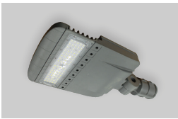
Dimension ( mm )

Model : ZERN-PTH-ZRSM-30W ZERN-PTH-ZRSM-50W ZERN-PTH-ZRSM-60W